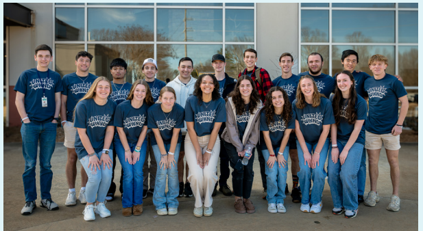
Some of our high school seniors at United Weekend in March.

On May 18, high school and college graduates will be recognized in our worship services (at 9:30 & 11:00). Following the 11:00 service, there will be a special lunch for graduates and their families in the Ministry Center.