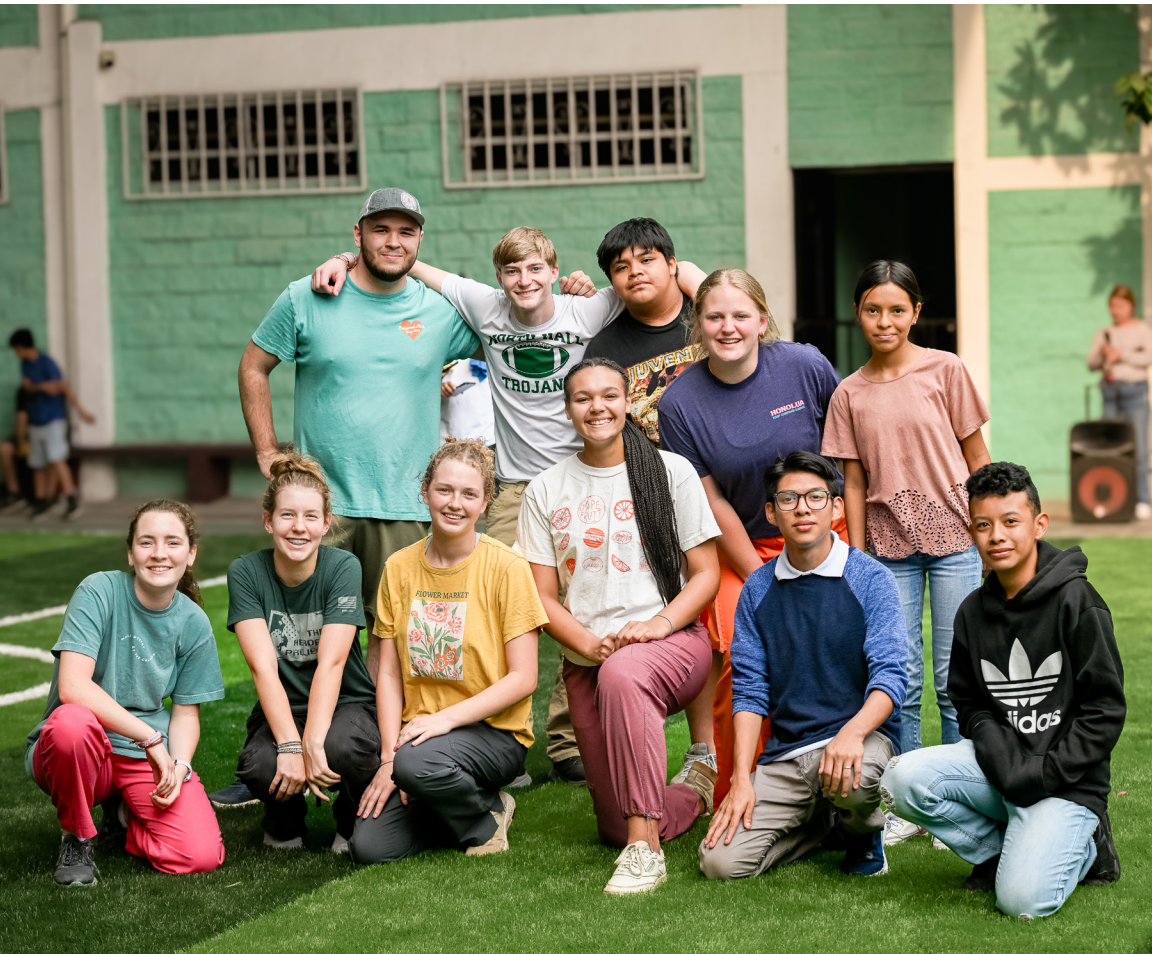
Guatemala Mission Trip