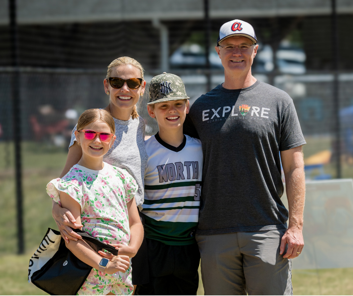
Summer at Lakewood