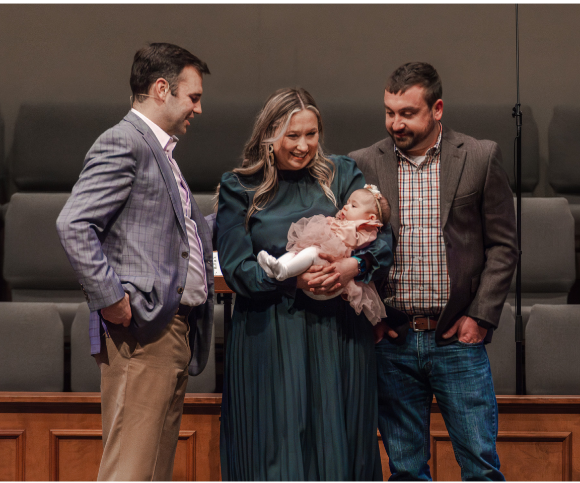
Parent Child Dedication