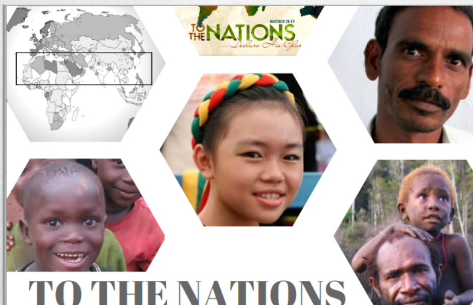
People Groups by Progress Scale

The focus of the Christian missions community 200 years ago was for the coastlands of the world. A century later, the success of the coastlands effort motivated a new generation to reach the interior regions of the continents. Within the past several decades, the success of the inland thrust has led to a major focus on people groups. Today, followers of Christ are concentrating their efforts on the unreached peoples of the world, most of which are in the 10/40 Window.